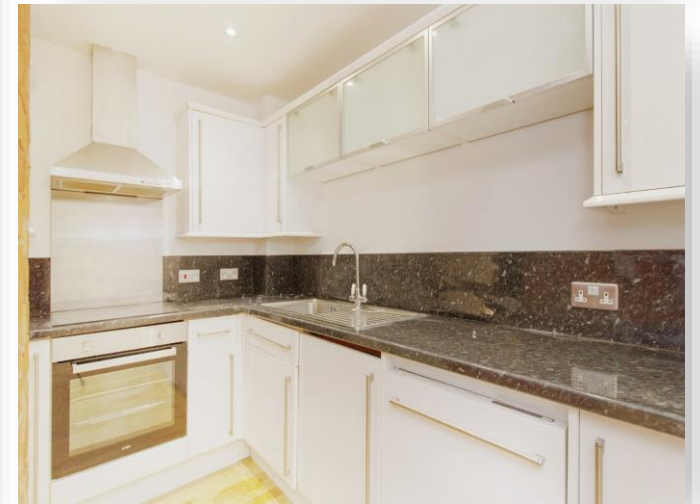
Marquis Street, Leicester LE1 6RS