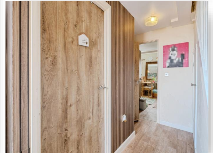
Hadden-Costello House Lansdowne Road, Leicester LE2 8AR