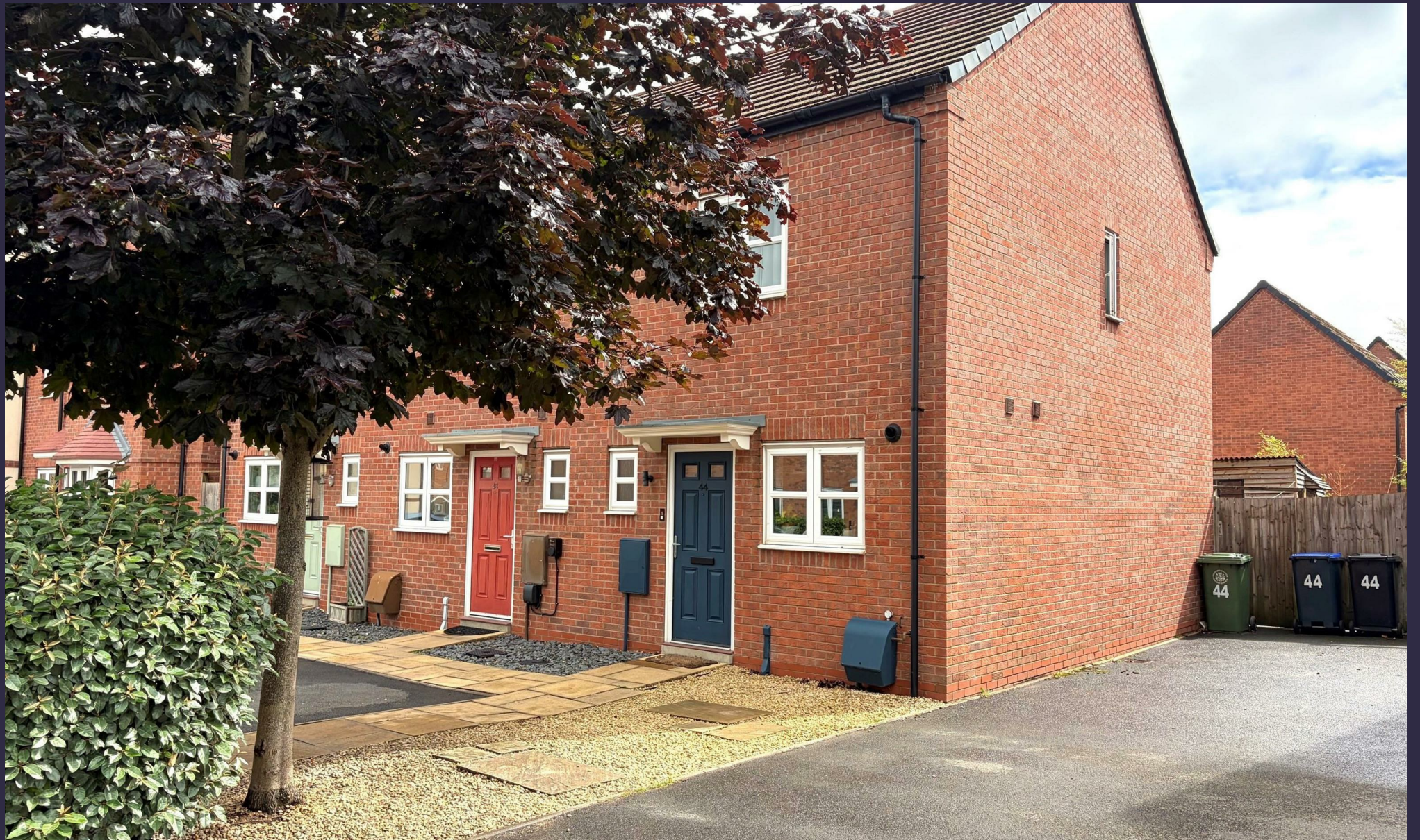
44 Chatham Road, Meon Vale, Stratford-Upon-Avon, CV37 8WG