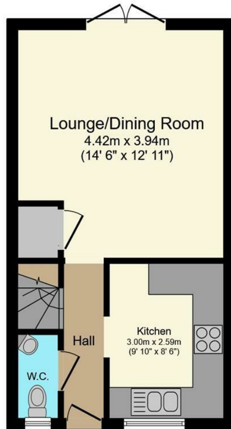
Ground Floor Floor area 30.1 sq.m. (324 sq.ft.)