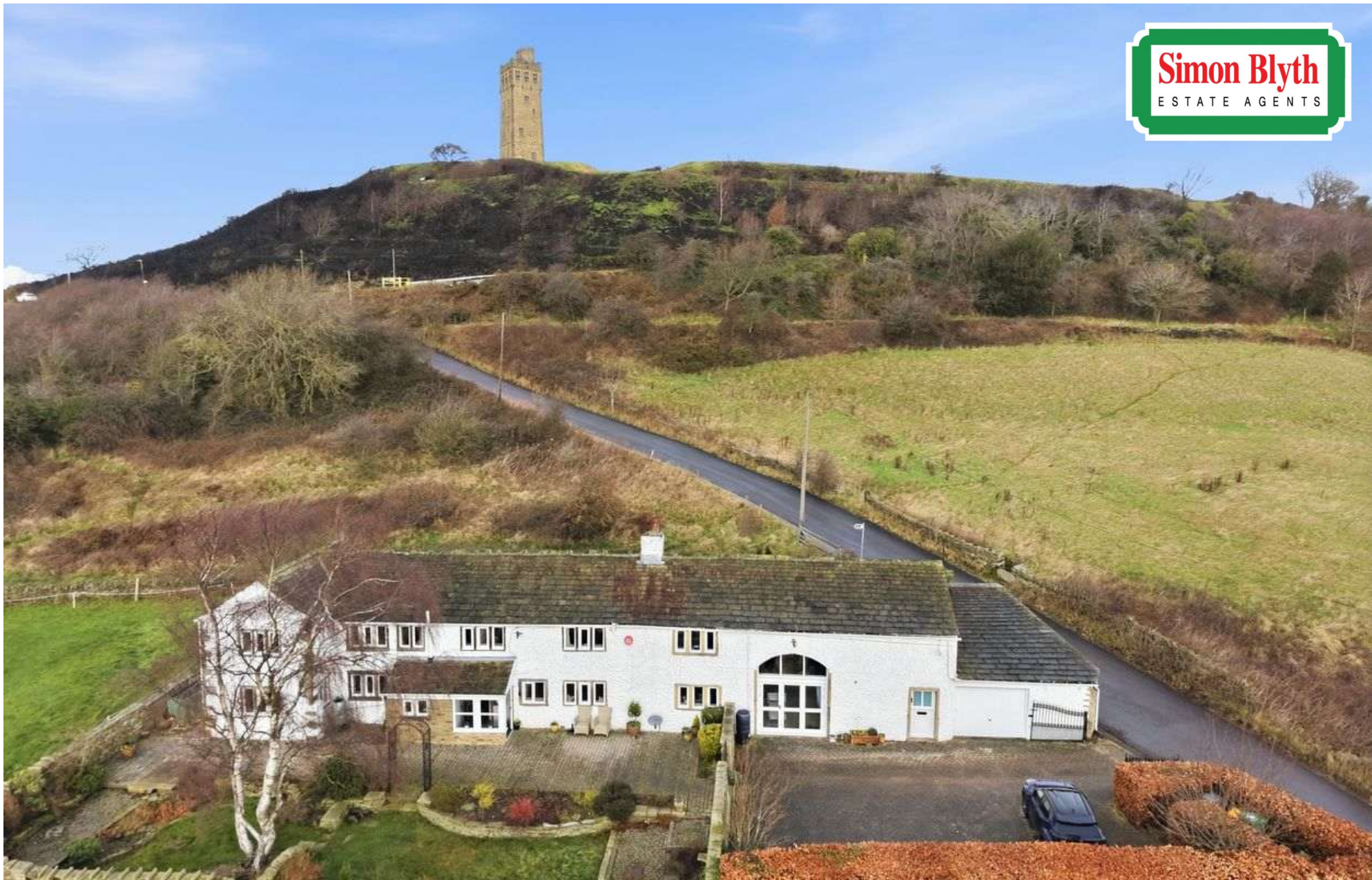
'Ogley' 59-61 Lumb Lane, Almondbury, Huddersfield, HD4 6SZ