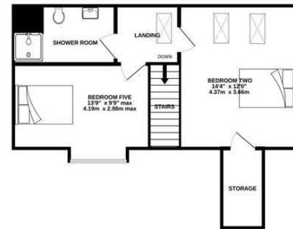
2ND FLOOR 446 sq.ft. (41.4 sq.m.) approx.