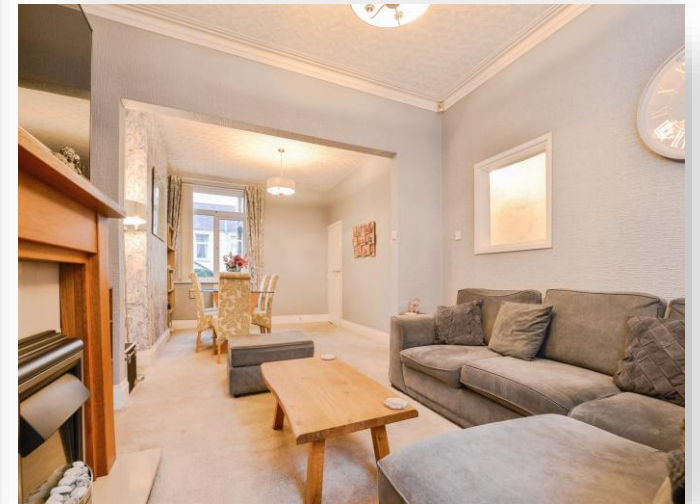
Castlereagh Road, Stockton-On-Tees TS19 0DL