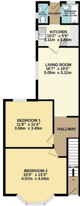
GROUND FLOOR 656 sq.ft. (60.9 sq.m.) approx.