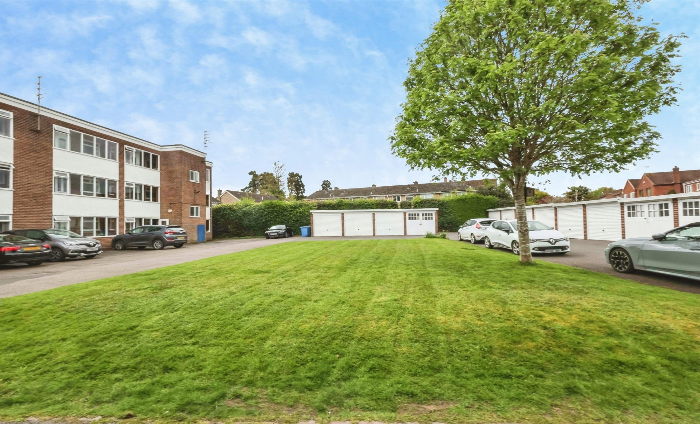
Broome Court, Water Orton Road, Birmingham