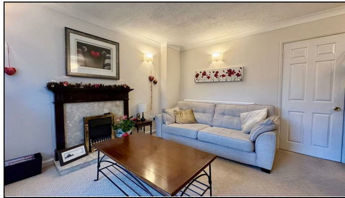
Glenfield Close, Sutton Coldfield, B76 1LD