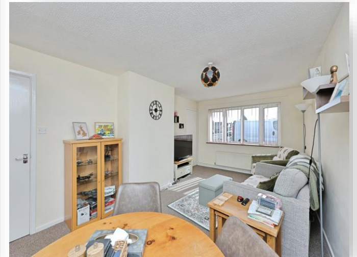
Langmere Road, Watton Thetford IP25 6LG