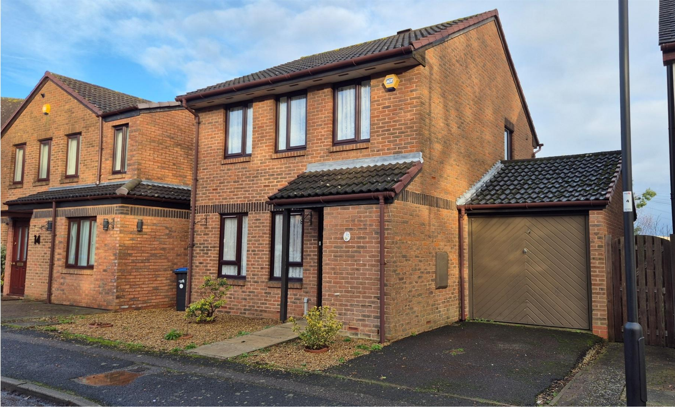
Chasewood Avenue, Enfield, EN2 8PT