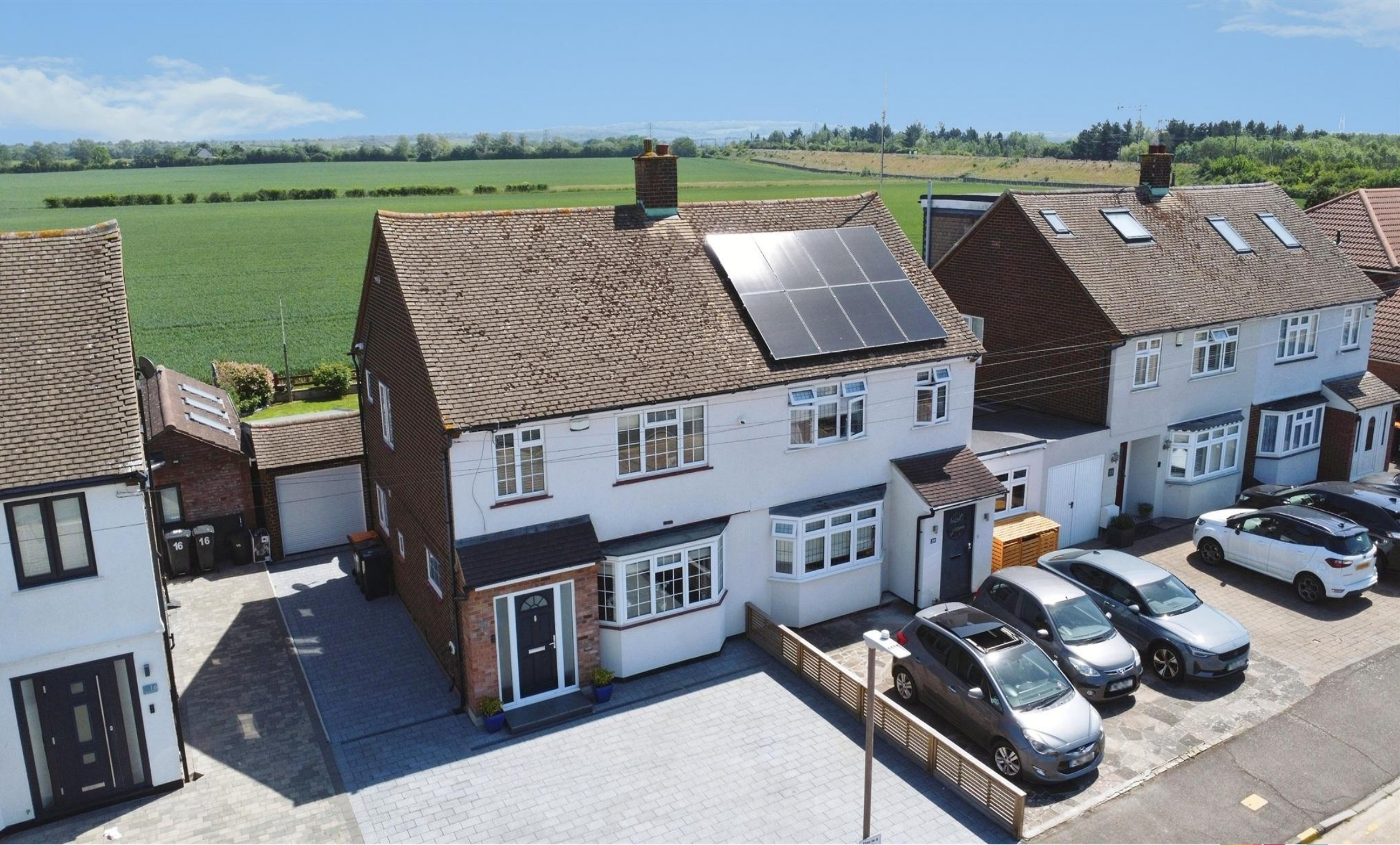
Clavering Gardens, West Horndon, Brentwood, CM13 3ND