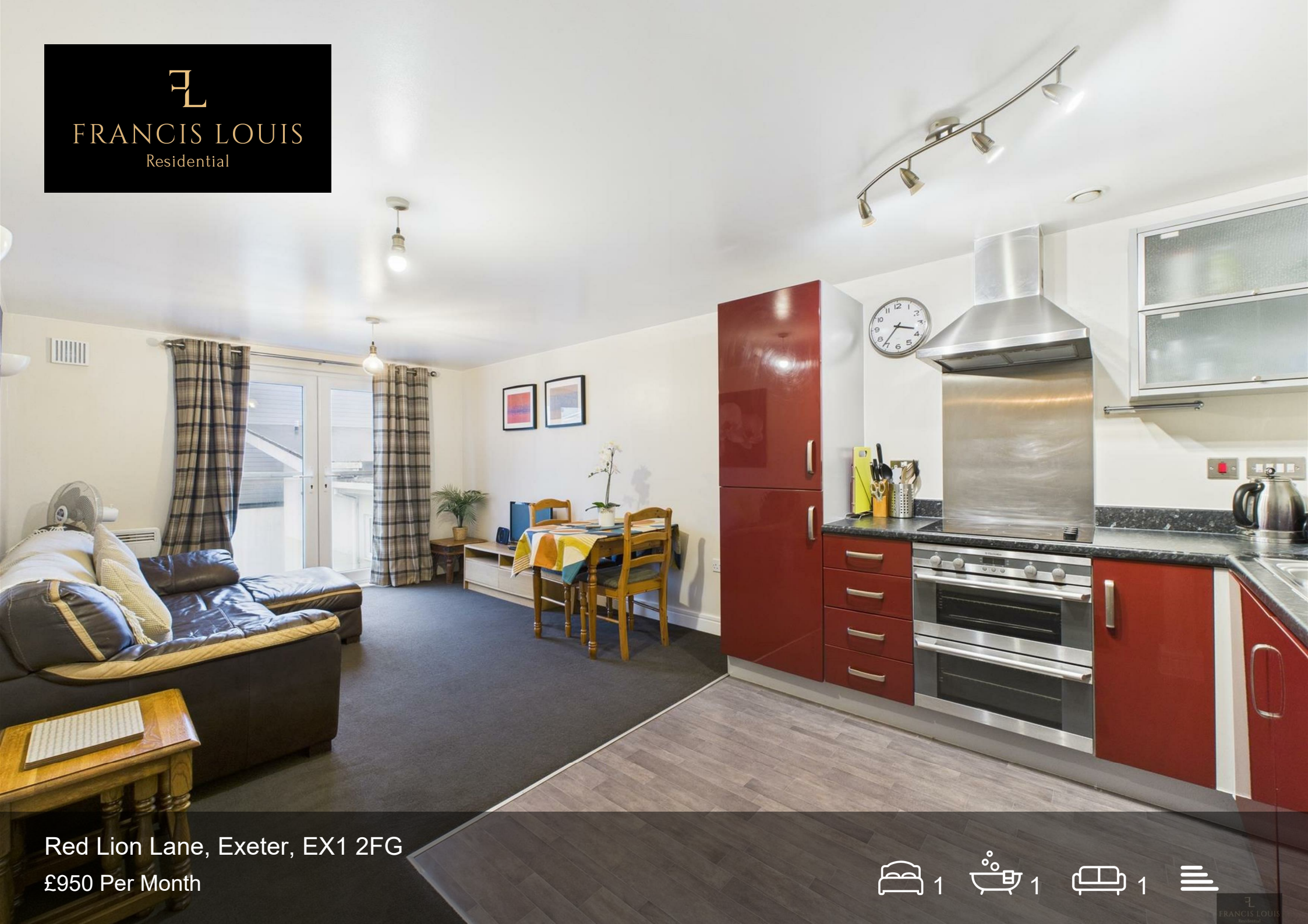
Red Lion Lane, Exeter, EX1 2FG £950 Per Month