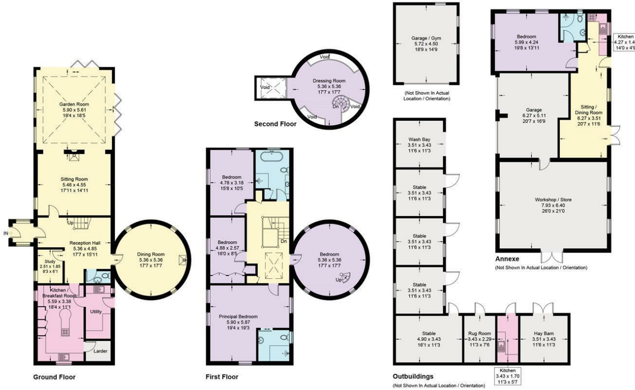
Illustration for identification purposes only, measurements are approximate, not to scale. Fourlabs.co © (ID1290813)