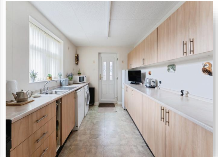
Childer Crescent, Little Sutton Ellesmere Port CH66 1RD