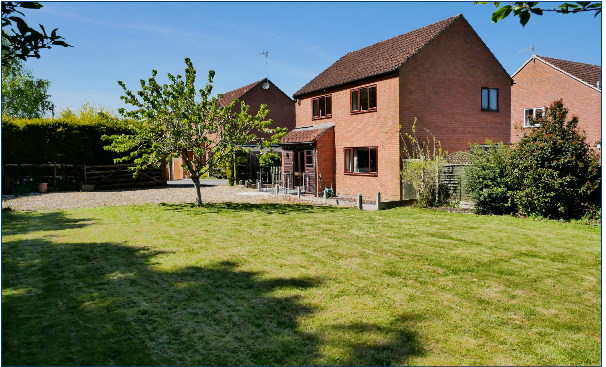
Fir Grove, Calne £390,000