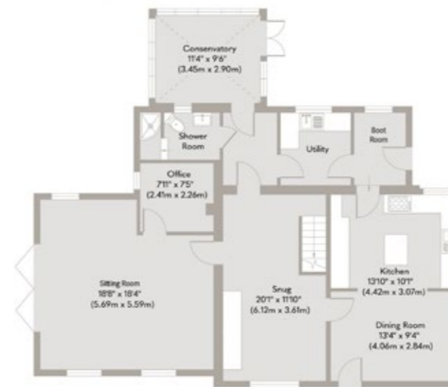
Ground Floor Approximate Floor Area 1247 sq. ft (115.86 sq. m)