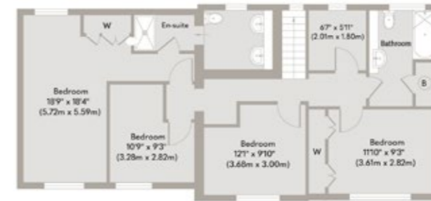
First Floor Approximate Floor Area 873 sq. ft (81.06 sq. m)