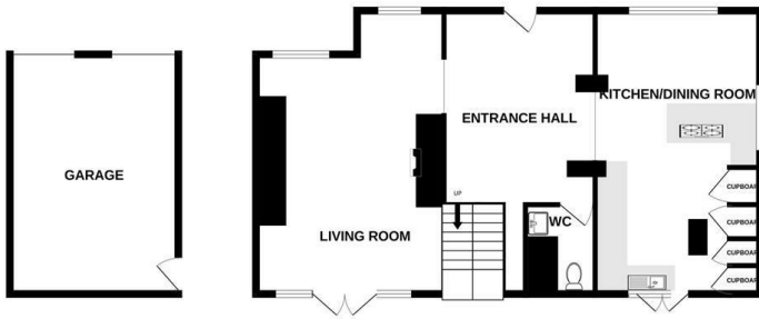
GROUND FLOOR 1002 sq.ft. (93.0 sq.m.) approx.