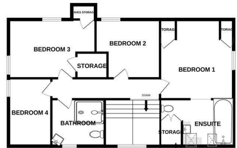
1ST FLOOR 856 sq.ft. (79.5 sq.m.) approx.