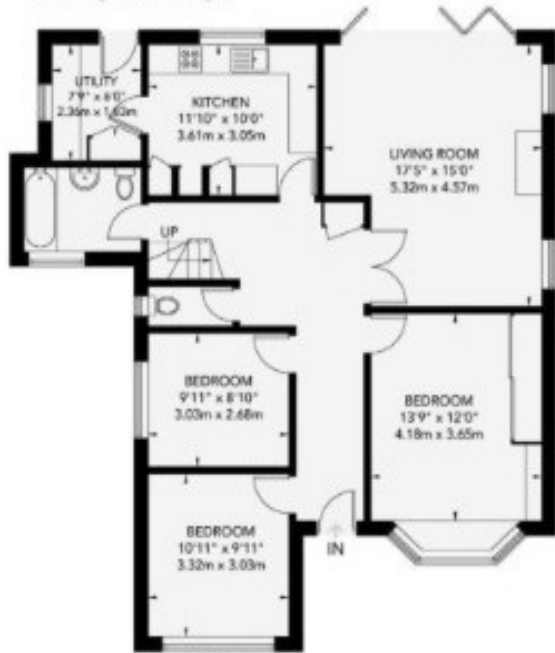
Ground Floor 96.2 sq m / 1035 sq ft