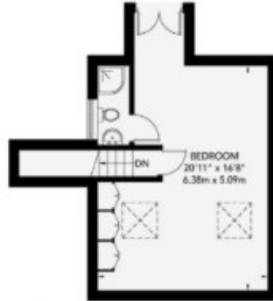
First Floor 38.3 sq m / 412 sq ft