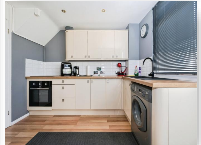
Canterbury Avenue, Southampton SO19 1EG