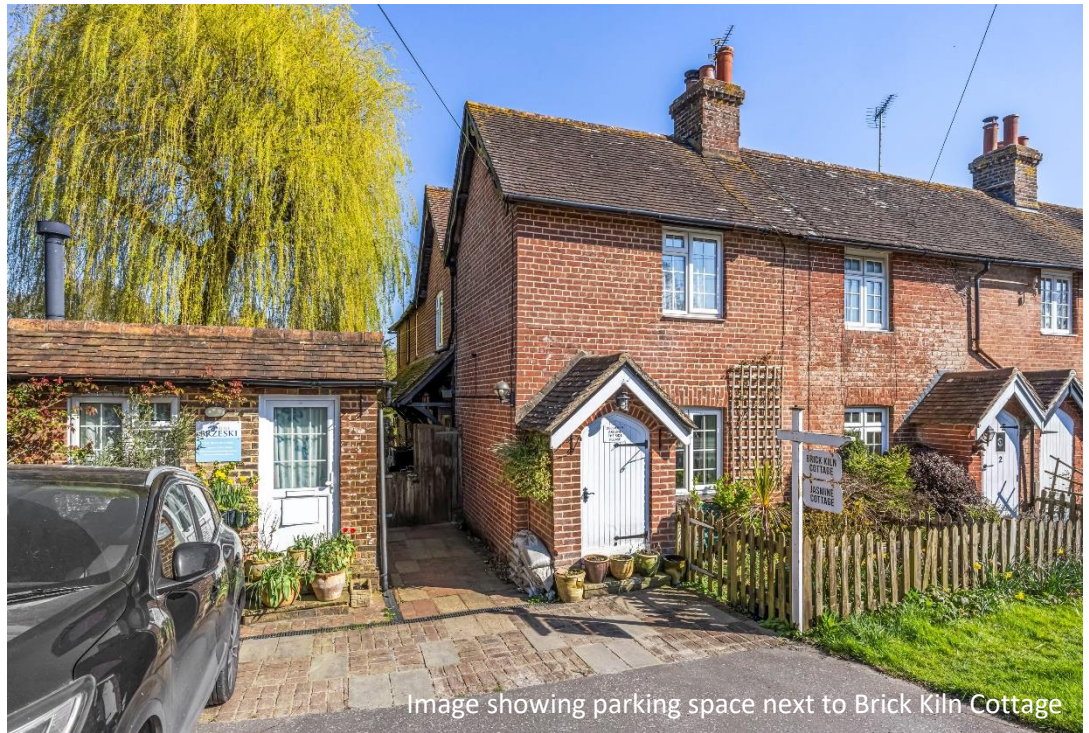
Image showing parking space next to Brick Kiln Cottage