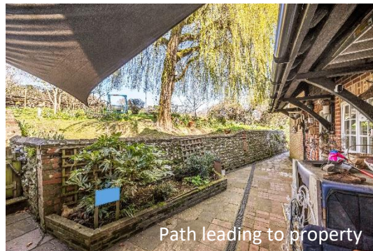
Path leading to property