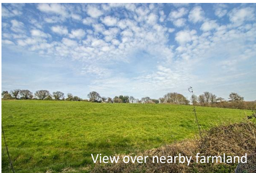
View over nearby farmland