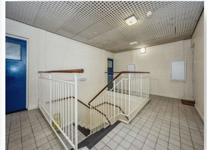
Philip Larkin House, The Avenue, Bedford, MK40 1EF