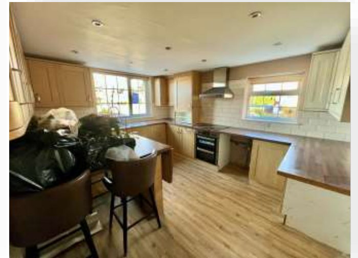
The Old Chapel Little London, Spalding PE11 2UA