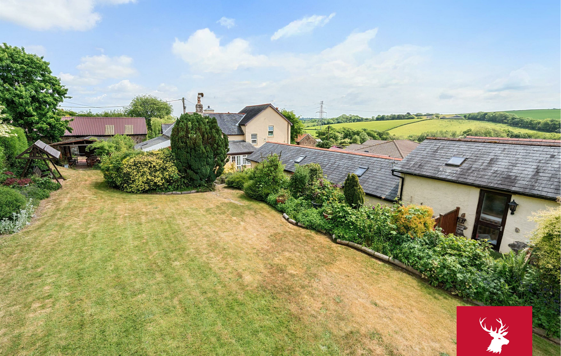
Balches & The Hayloft