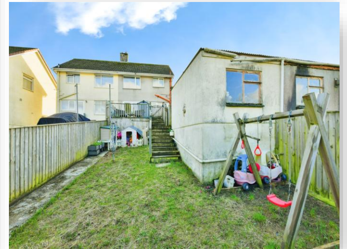
Underlane, Plympton Plymouth PL7 1QZ