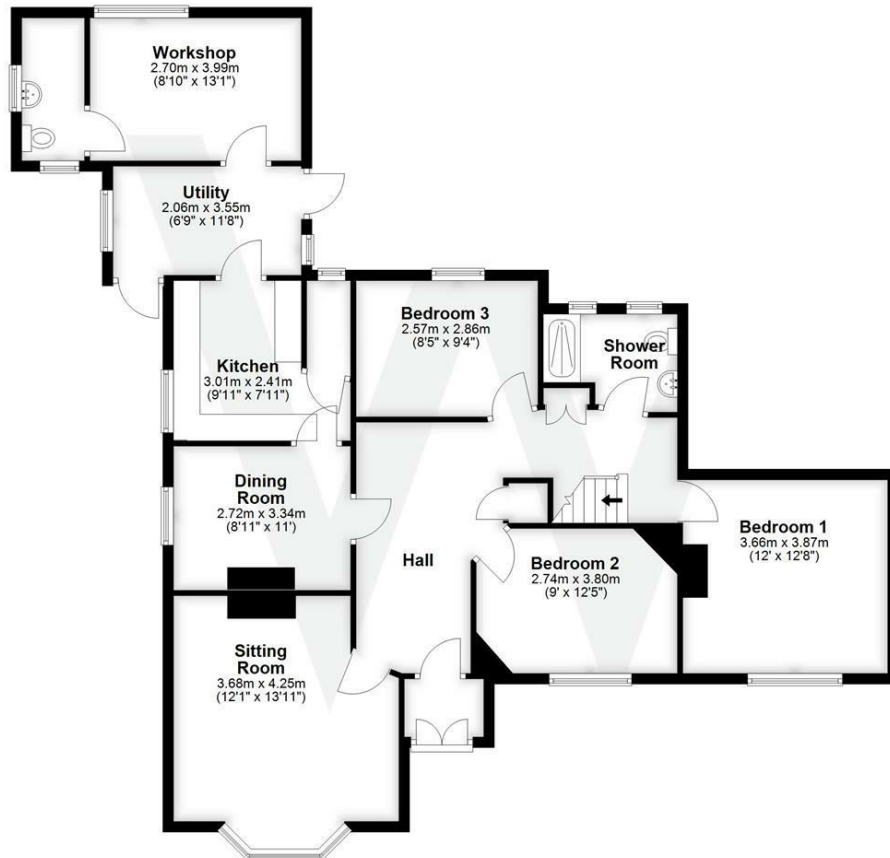
Ground Floor Approx. 119.6 sq. metres (1287.5 sq. feet)

Total area: approx. 142.2 sq. metres (1531.0 sq. feet)