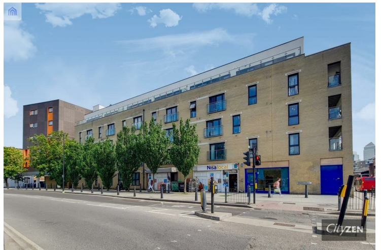
PARK VIEW COURT