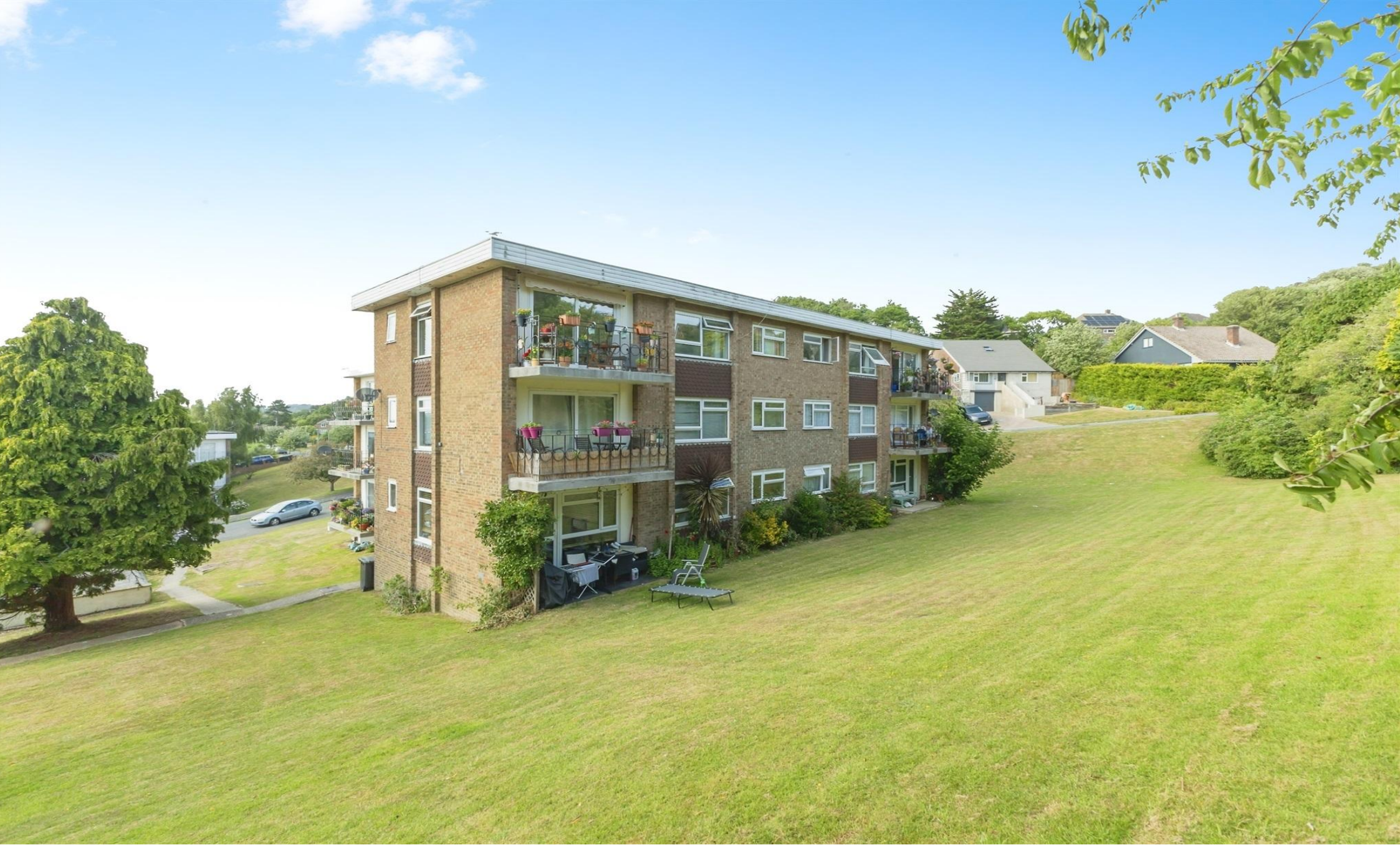
Campbell Court Gresham Way, St. Leonards-On-Sea TN38 0UG