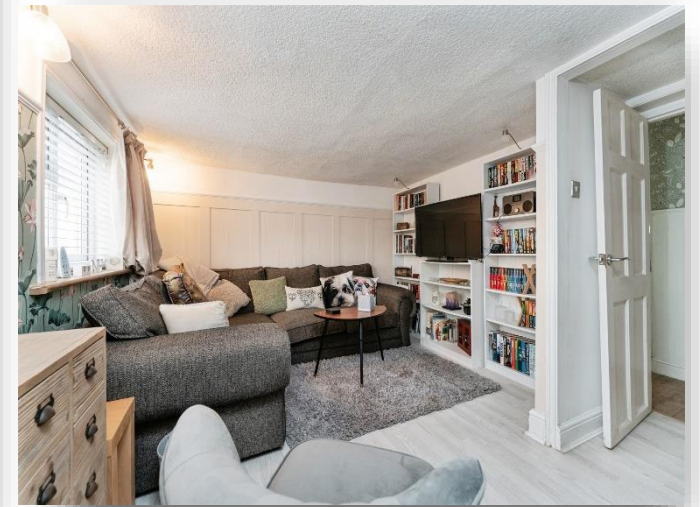
Bridge Street, Chatteris PE16 6RN