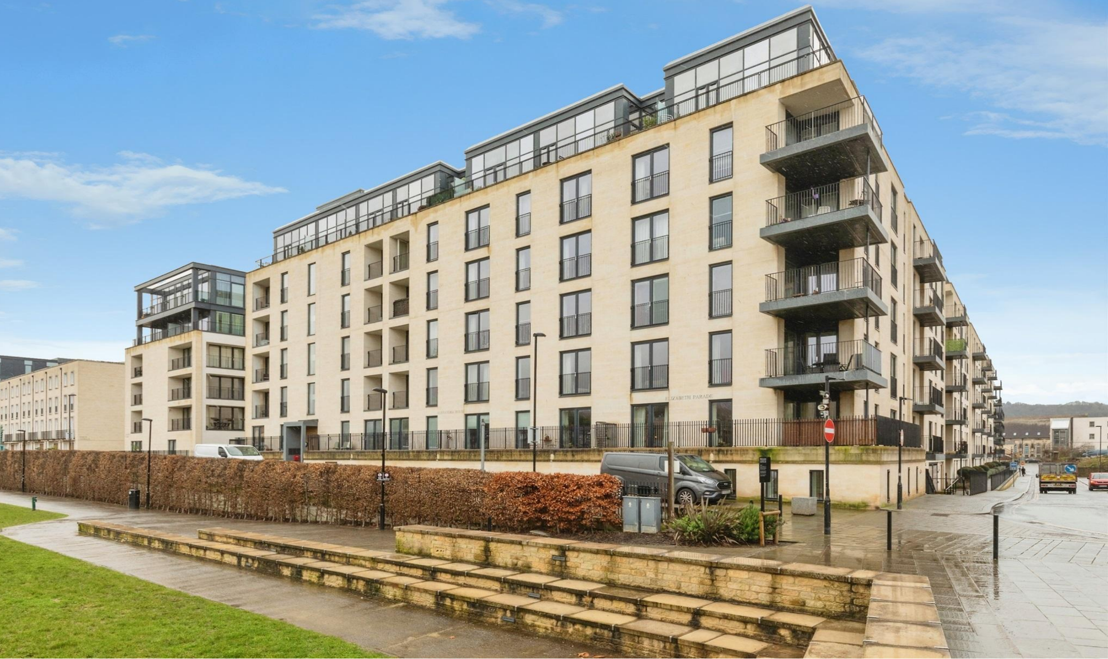
Alexandra House Midland Road, Bath BA2 3GD