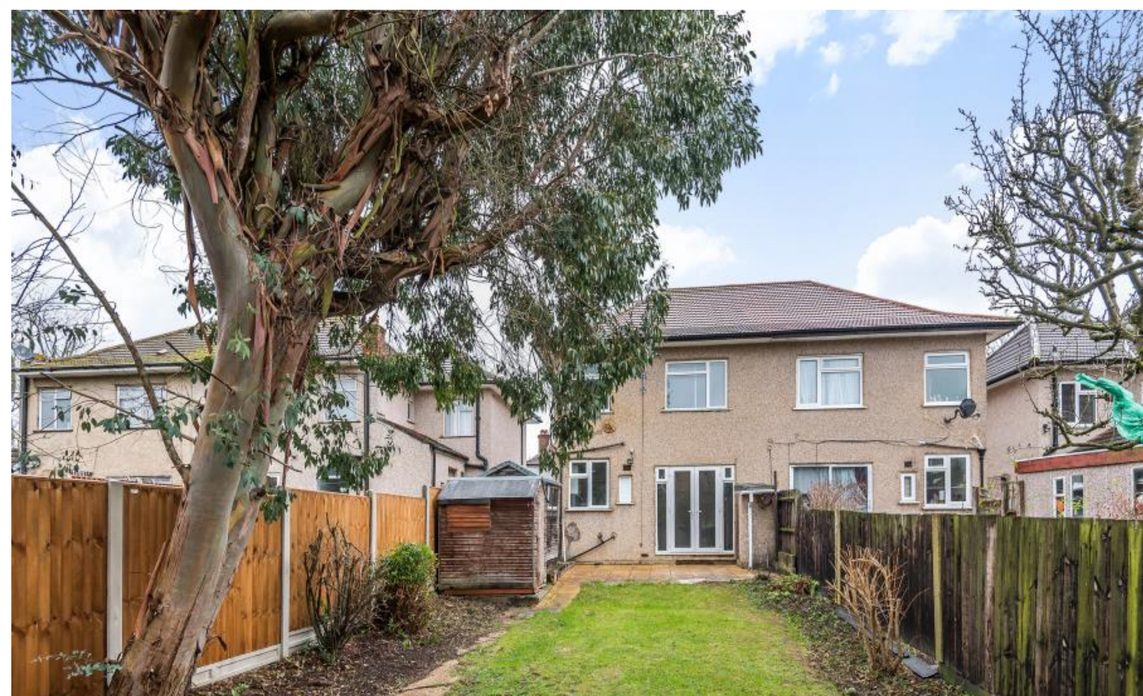
A Newly Refurbished Three Bedroom Semi Detached Family Home Waverley Road, Harrow, HA2 9RF