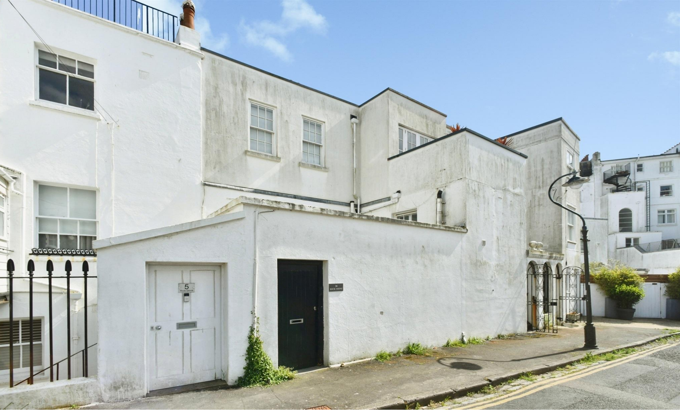
Rock Grove, Brighton BN2 1ND