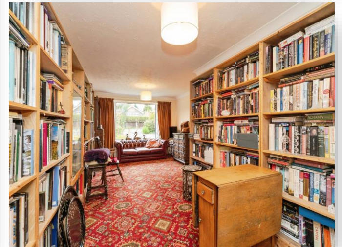
Carinya Norwich Road, Corpusty Norwich NR11 6QD