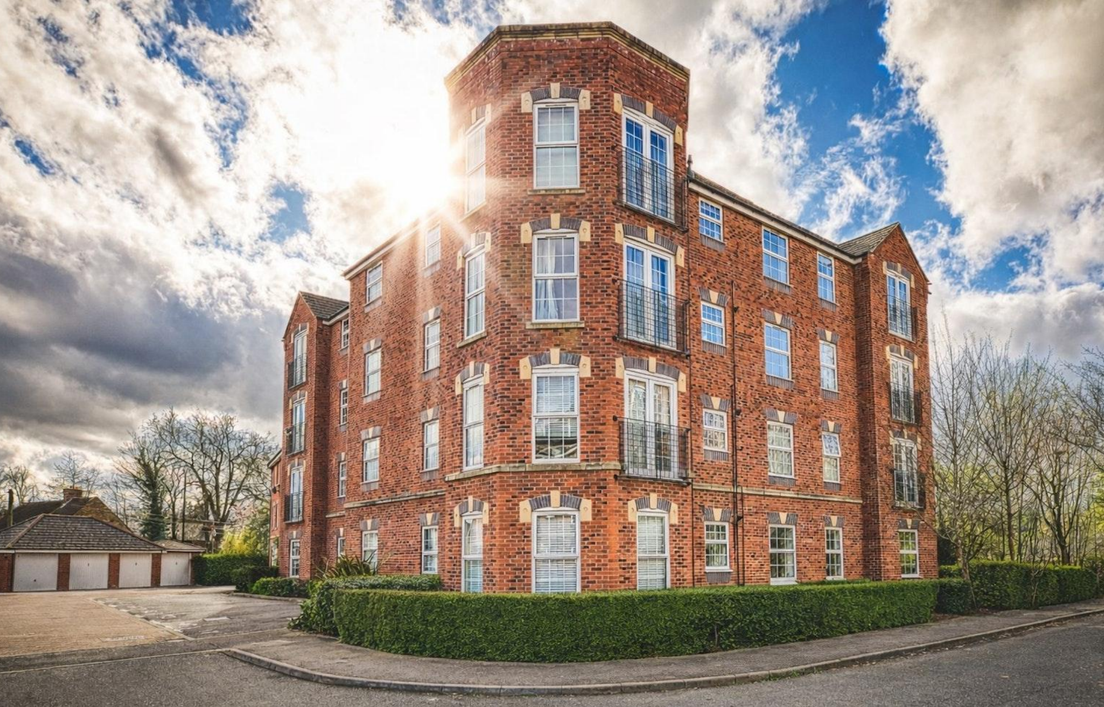
Magnus Court, Chester Green, Derby