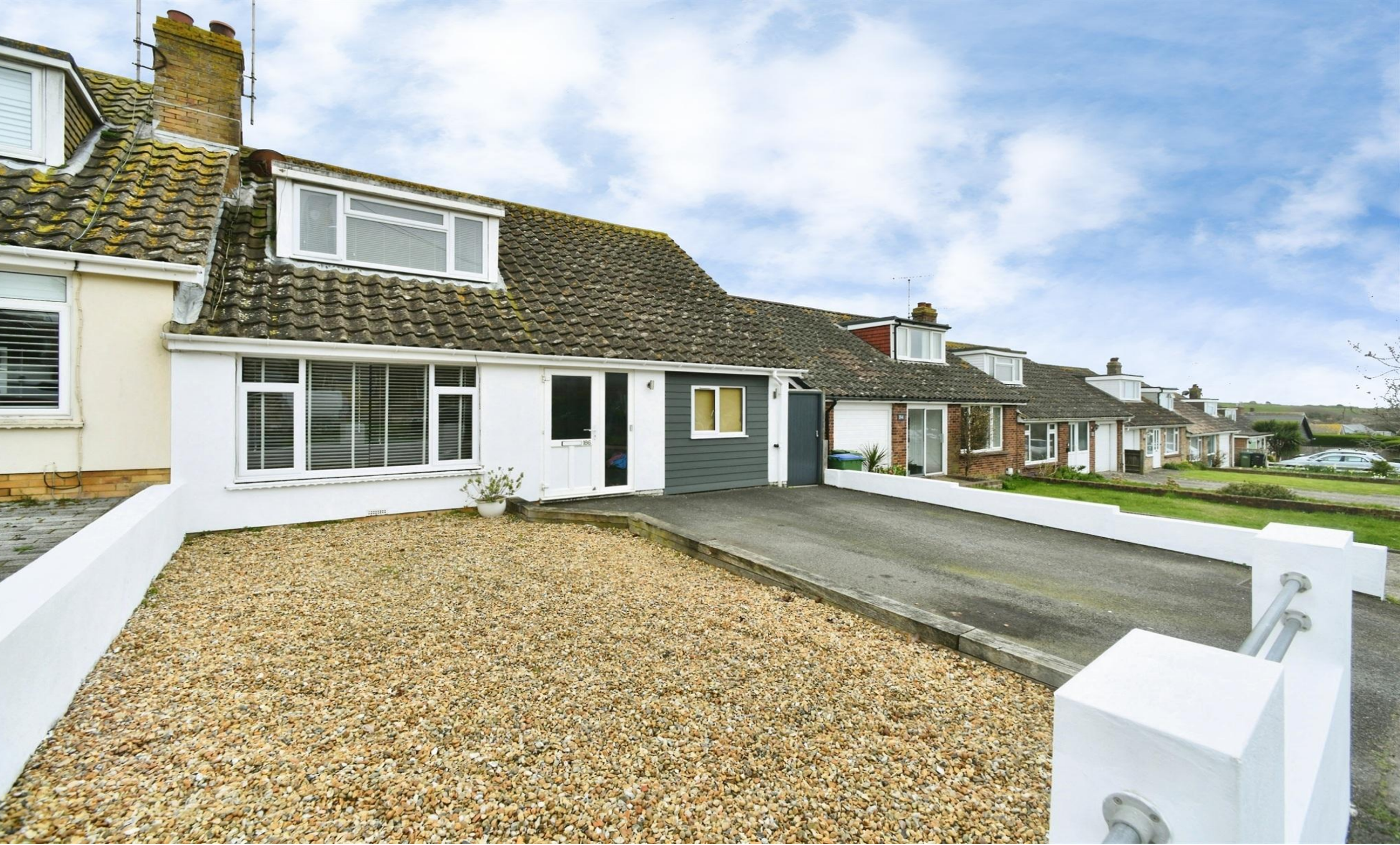
Bannings Vale, Saltdean Brighton BN2 8DJ