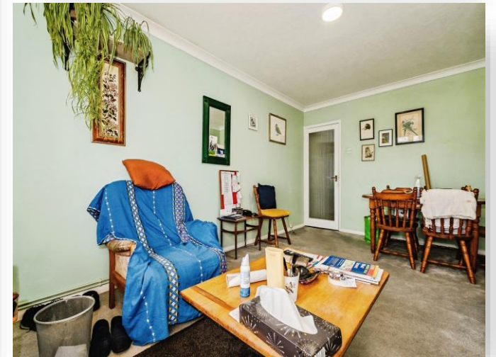
Southon View Western Road,Lancing BN15 8RT