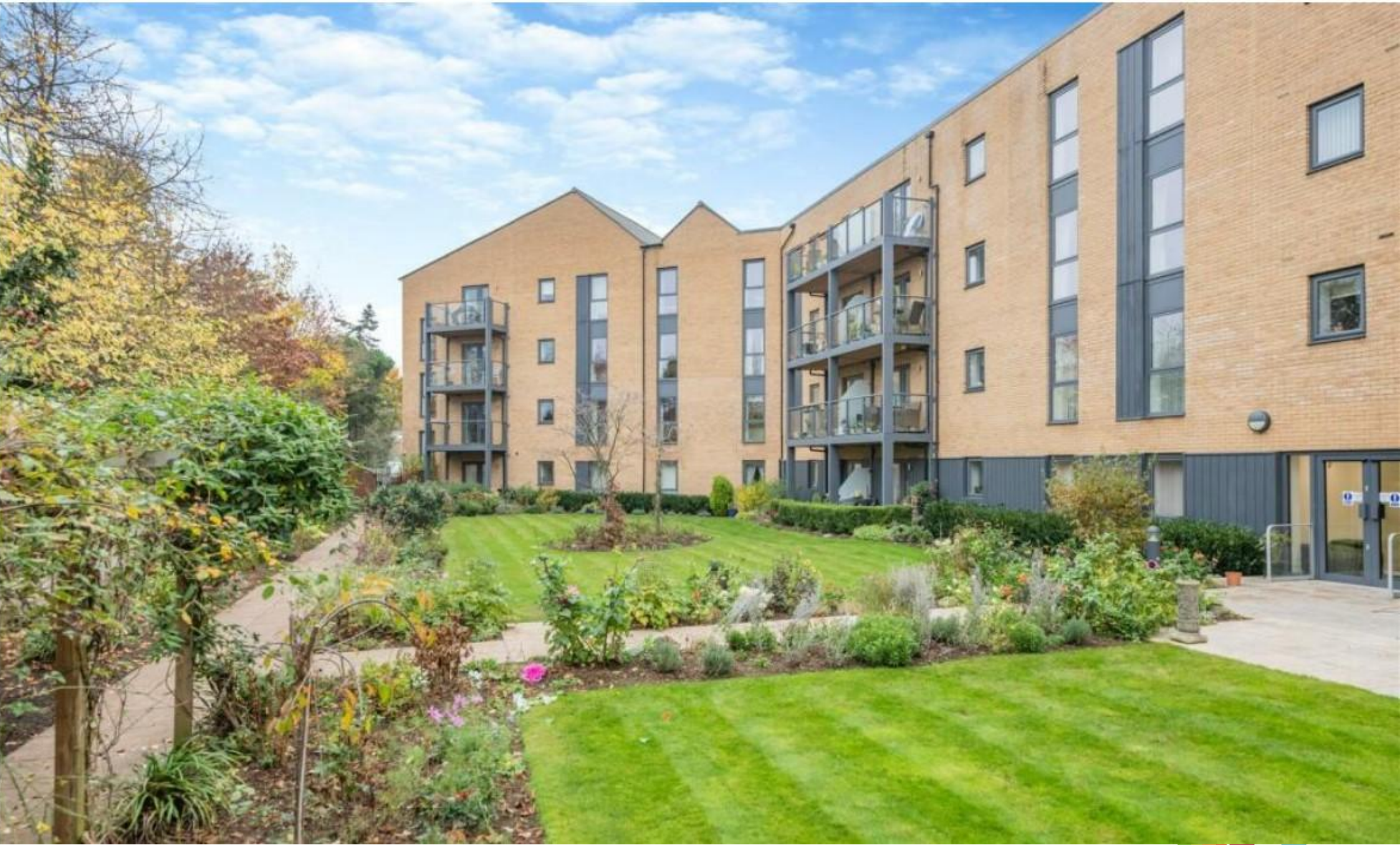
Miami House Princes Road, Chelmsford CM2 9GE