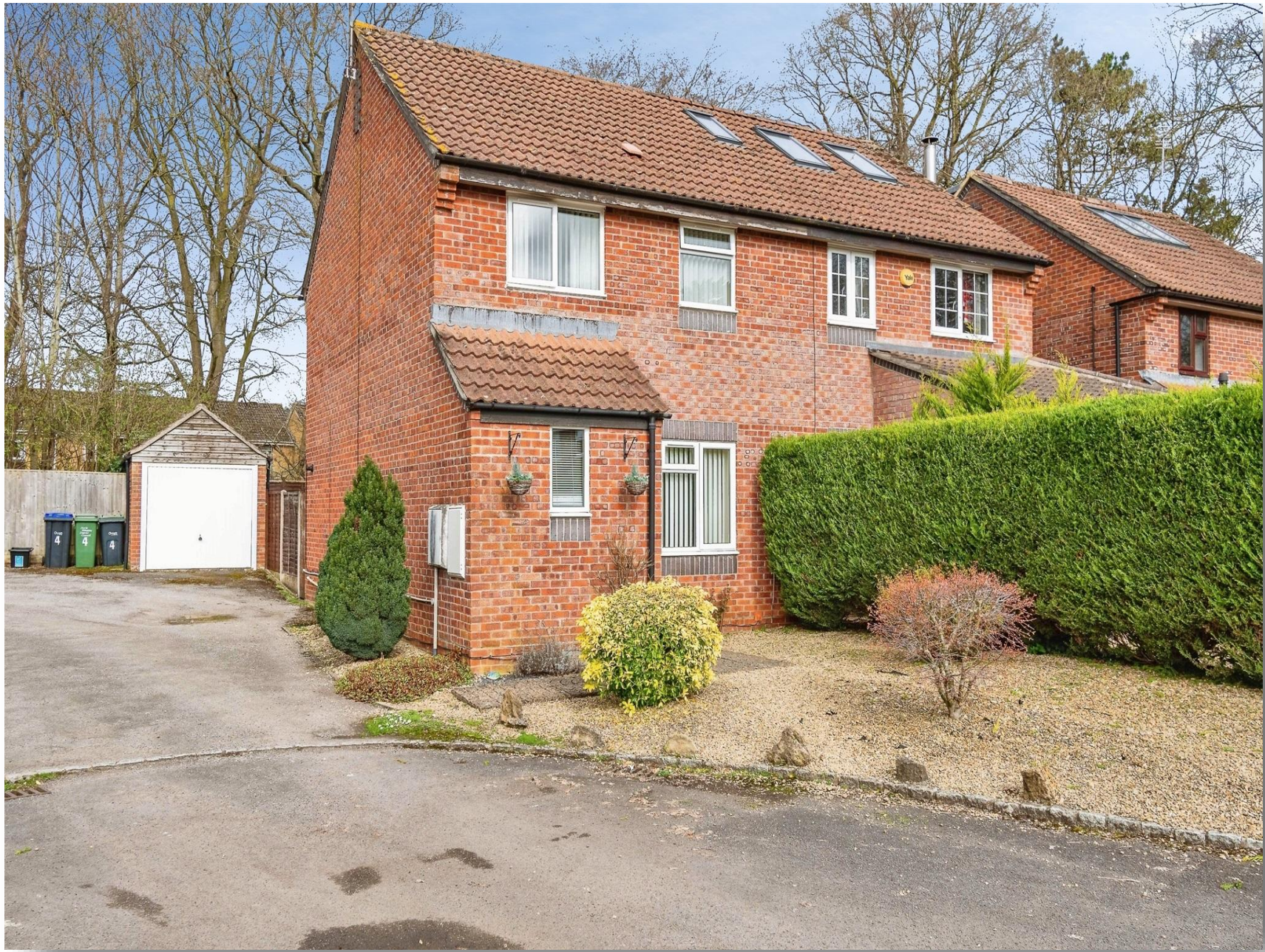
Lydiard Road, Chippenham SN14 0NZ