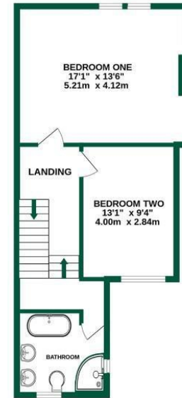
FIRST FLOOR 532 sq.ft. (49.4 sq.m.) approx.