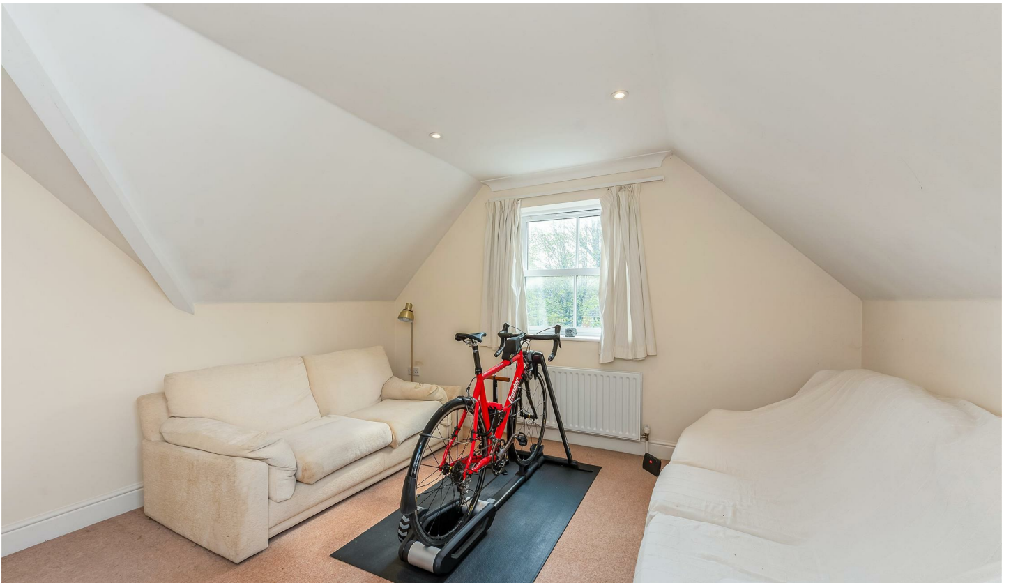
Full Description A two bedroom top floor flat