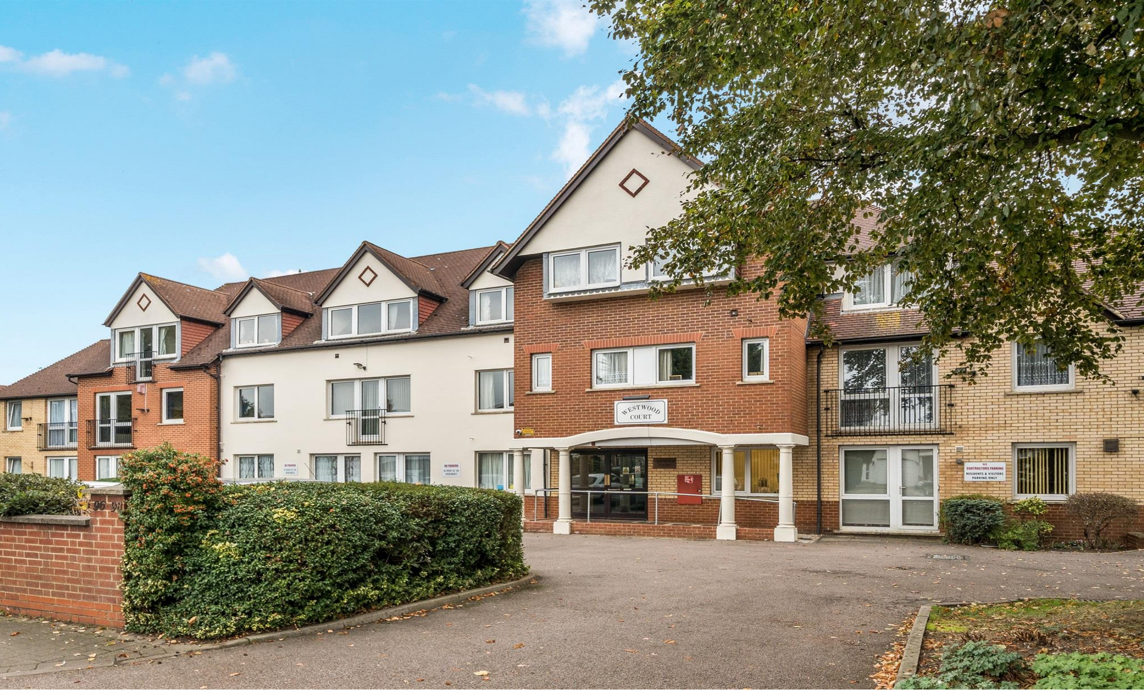
Westwood Court, Village Road, Enfield, EN1 2HQ