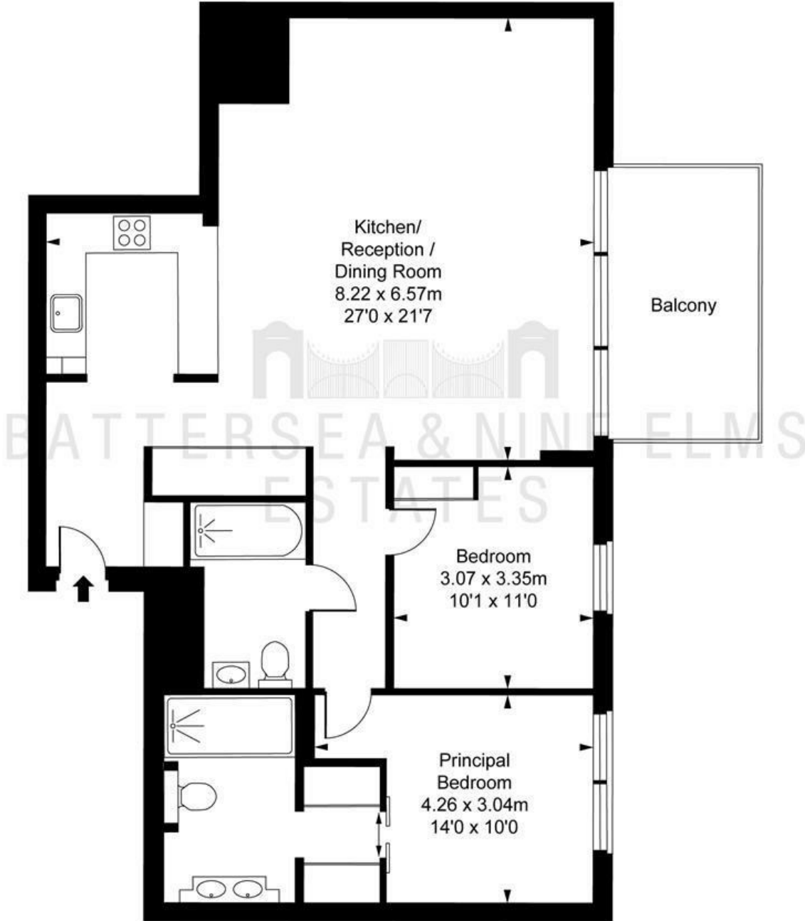
ILLUSTRATION FOR IDENTIFICATION PURPOSES ONLY ALL MEASUREMENTS AND AREA FIGURES SUPPLIED BY OTHERS. ACCURACY IS NOT GUARANTEED. THIS PLAN MUST NOT BE REPRODUCED BY ANY OTHER PERSON WITHOUT PERMISSION

These particulars, whilst believed to be accurate are set out as a general outline only for guidance and do not constitute any part of an offer or contract. Intending purchasers should not rely on them as statements of representation of fact, but must satisfy themselves by inspection or otherwise as to their accuracy. No person in this firm's employment has the authority to make or give any representation or warranty in respect of the property.