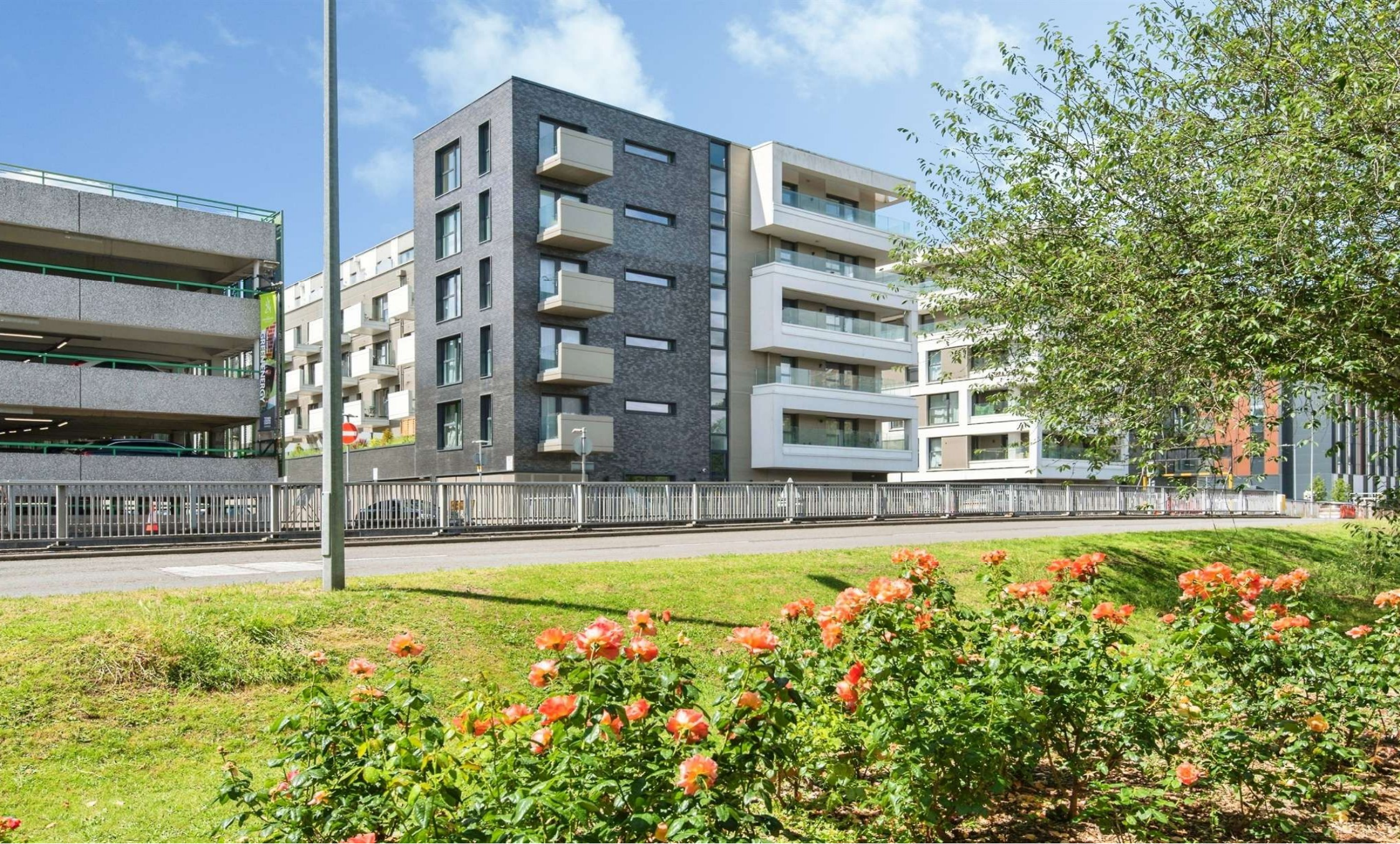
Mulberry House Park Place, Stevenage SG1 1BH