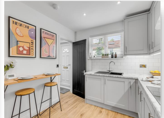
Gipsy Lane, Norwich, NR5 8AY