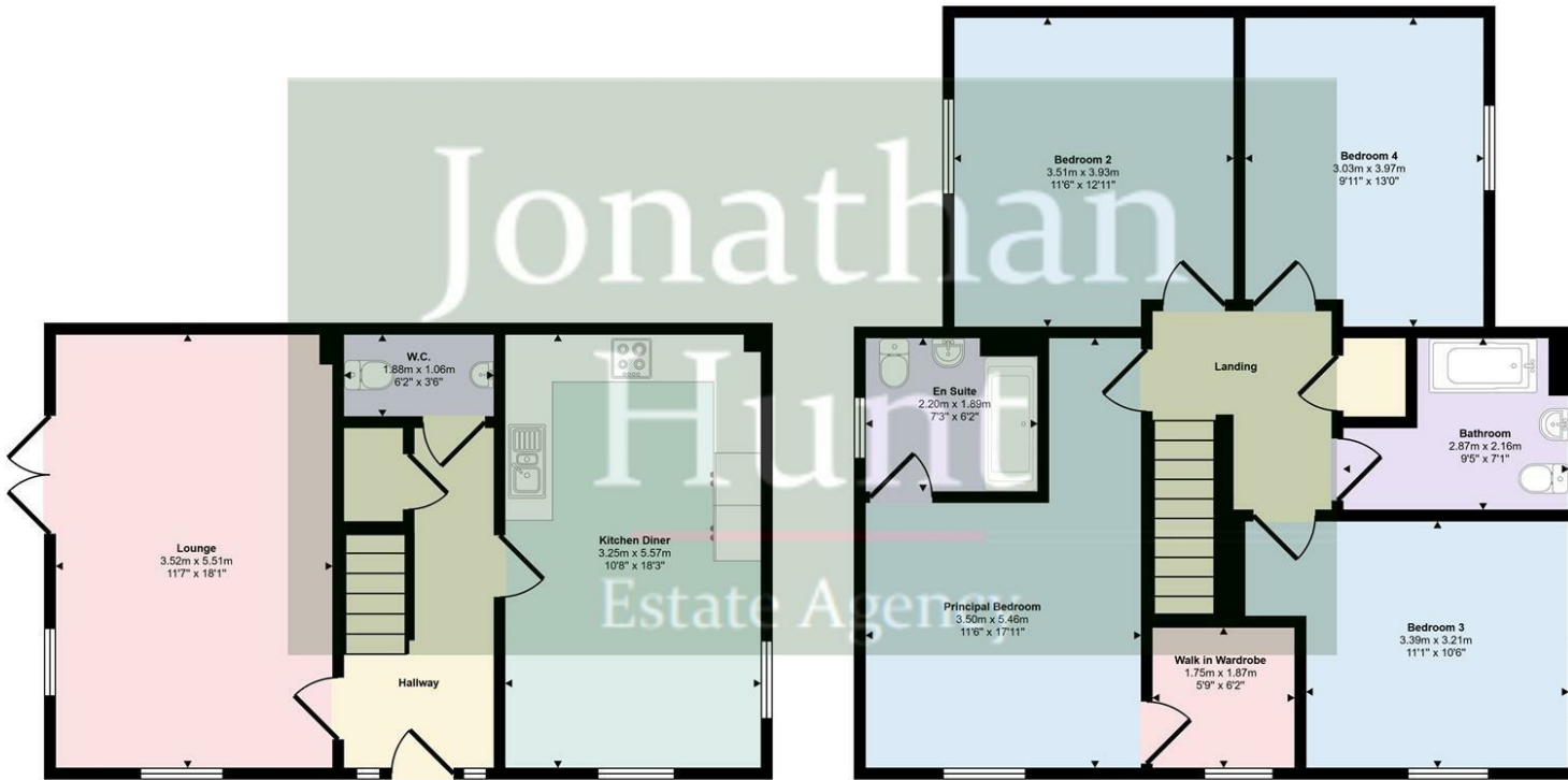
Ground Floor Approx 50 sq m / 534 sq ft

Approx Gross Internal Area 126 sq m / 1355 sq ft