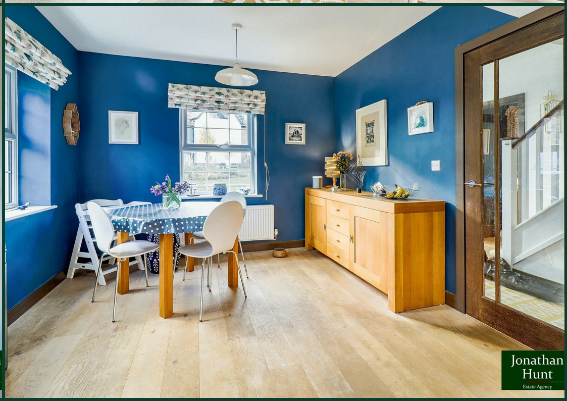
Jonathan Hunt Estate Agency