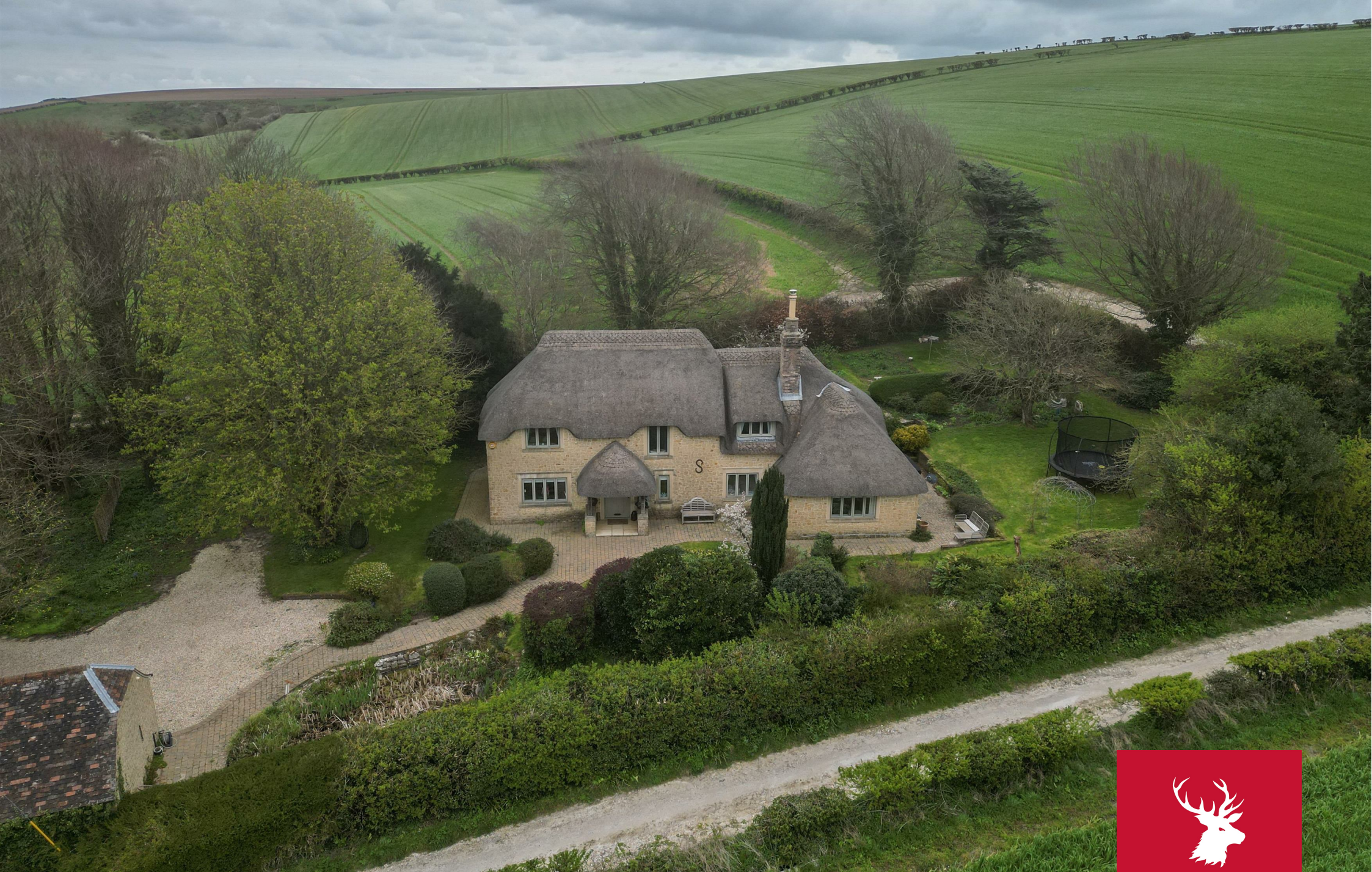
Orchard House, Chydyok Road