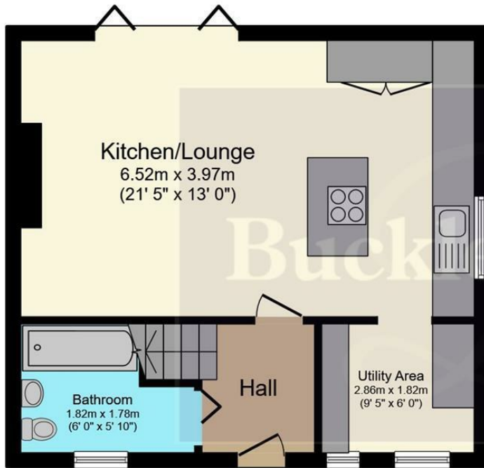
Ground Floor Floor area 38.6 sq.m. (416 sq.ft.)