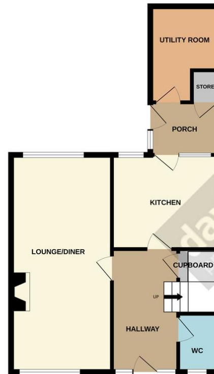
GROUND FLOOR 54.4 sq.m. (585 sq.ft.) approx.