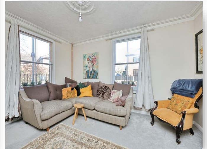
Corton Road, Norwich, NR1 3BS