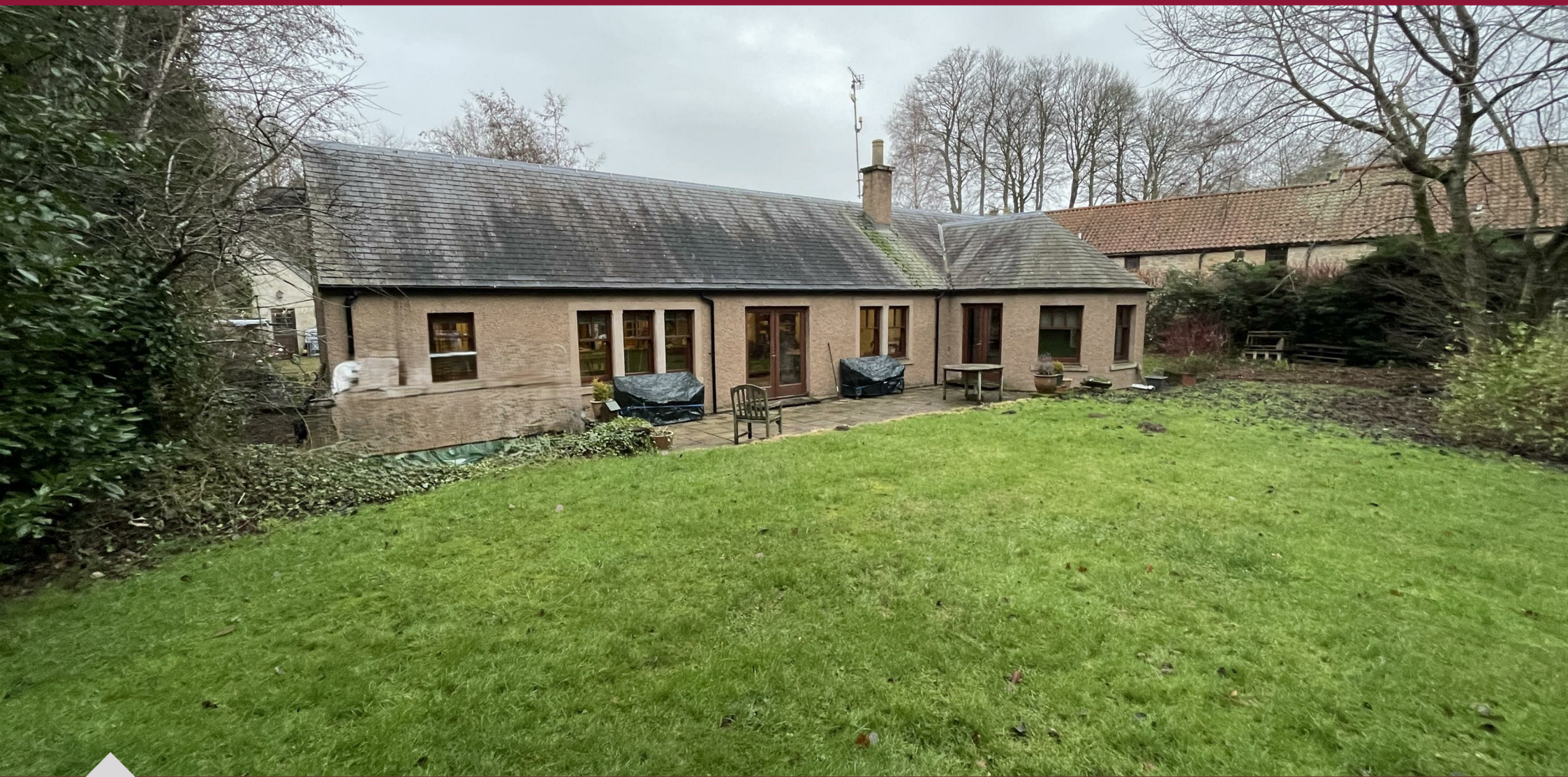
The Bungalow Cults Mill, Cupar, KY15 5RD Offers Over £600,000